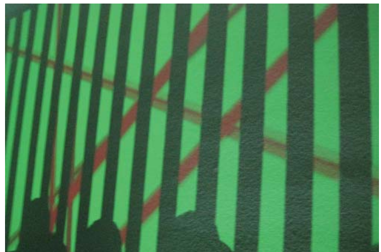
Second Layer Screen Projection