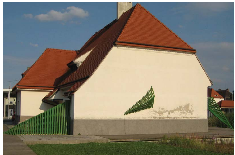
Sheep stalls and Parascapes