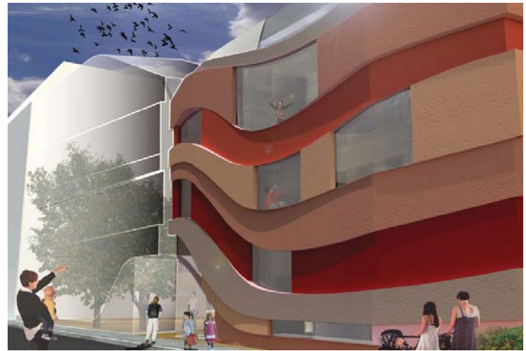
View from Steinstraße

As an extension of the interior spaces for the elder children, a rooftop terrace can be used by elder children as an outdoor play area.