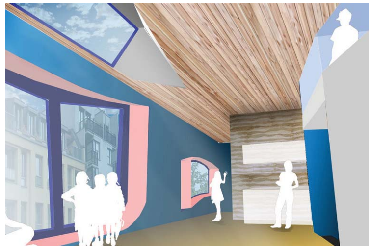
Hort der Altersgruppe 10 - 12